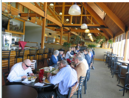
Members enjoying their lunch @ Mahoney State Park.