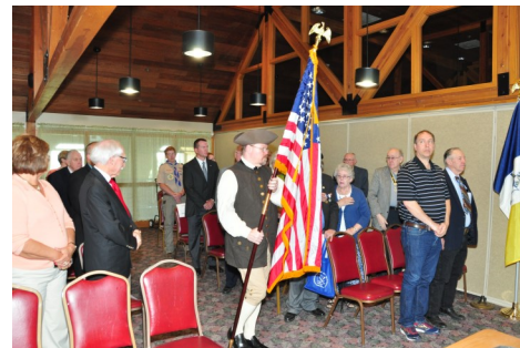
Color Guard posting the Colors