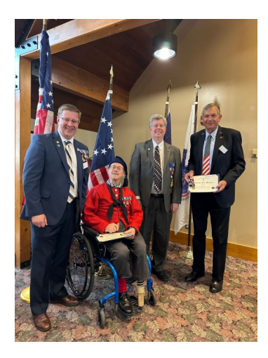
Bronze America 250