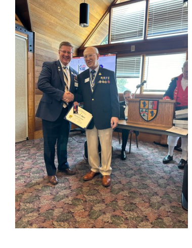
Silver Good Citizenship